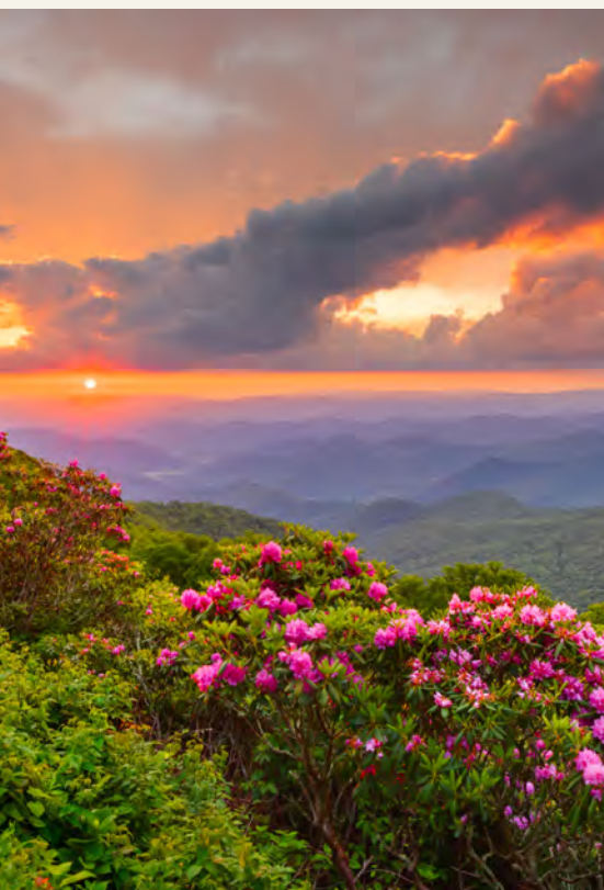
For information and nearby attractions, please see the Concierge Desk in The Great Hall.