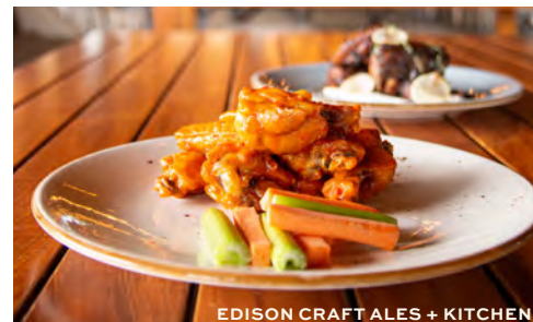
EDISON CRAFT ALES + KITCHEN

Enjoy your summer favorites poolside or make a stop along the course to refuel, located adjacent to the Golf Pro Shop and Outdoor Pool. Check out the Summer of Citrus menu, offered exclusively at the Cabana Grill & Bar with summer fare for adults and kids alike.