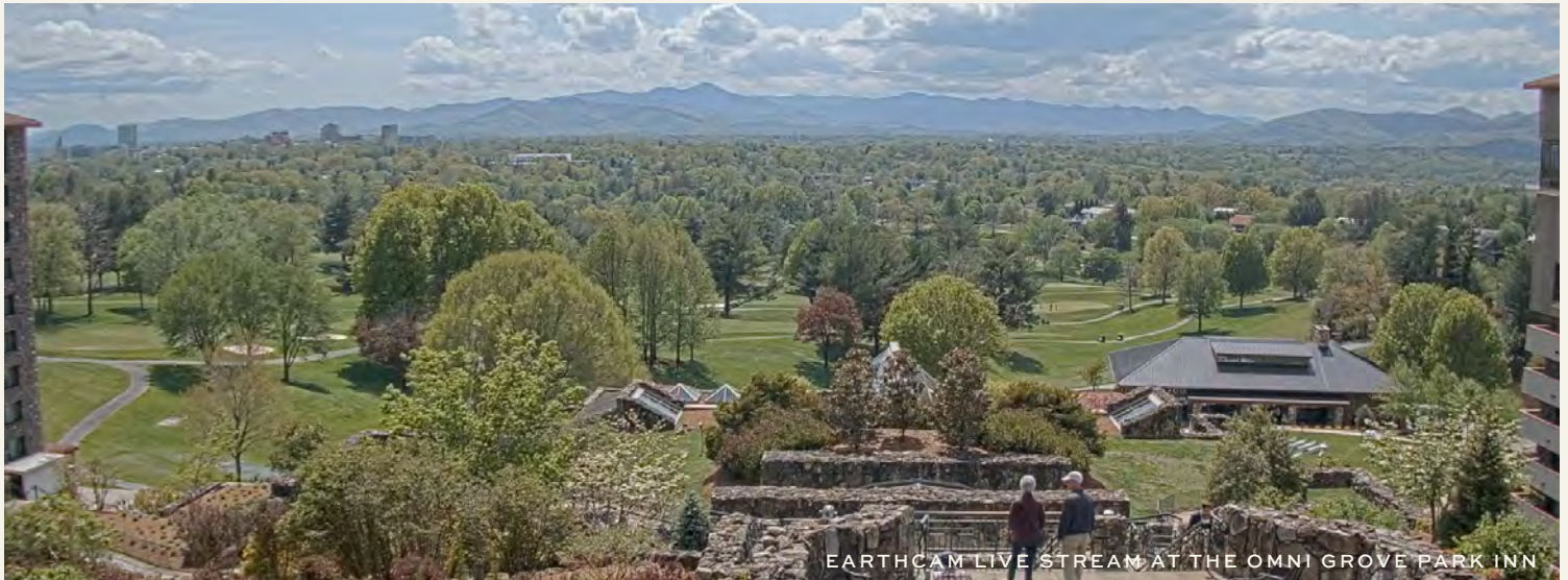
EARTHCAM LIVE STREAM AT THE OMNI GROVE PARK INN